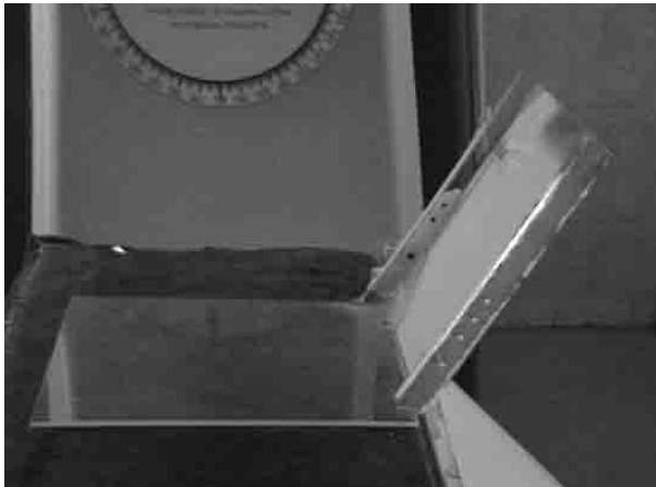
Figure 1. The dedicated cassette holder made from perspex is shown on the treatment couch.

A PC based charge-coupled device (CCD model: RAD system) with 8 bits per pixel and with pixel resolution of 640 \times 480 was used to digitize the portal images. All the images had the same "TIFF" format compatible to the image processing tool box of the MATLAB